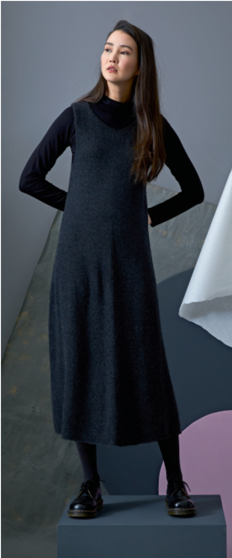
26 cashmere lace